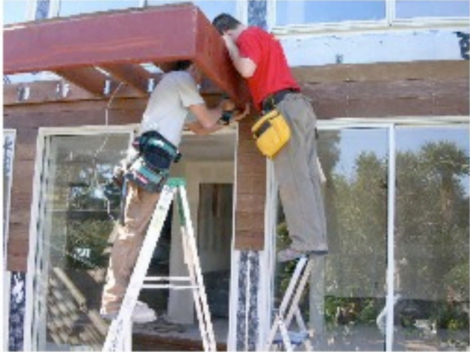
During construction, workmen affix wood joists to new cantilevered steel beams.

The primary concept for the house was a 'wall of glass'. The deck above creates a ceiling for the outdoor room below.