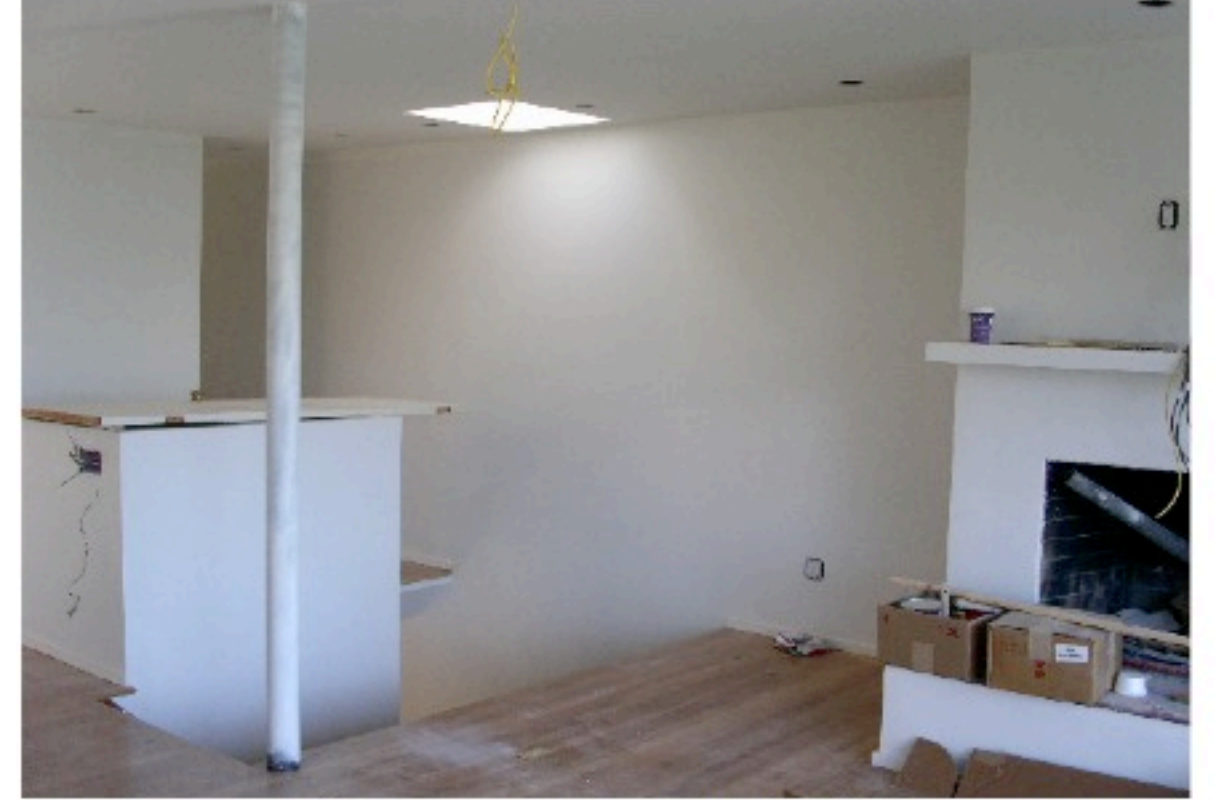
Construction: interior walls were removed to unify the top floor.

The deck beyond is stepped down to preserve views from the interior.